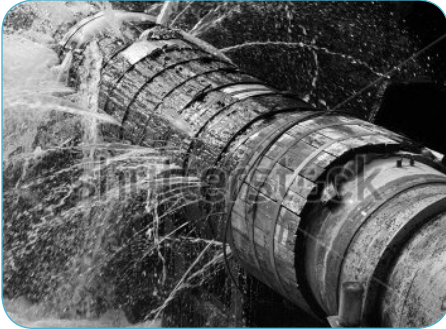
Plug the biggest profit leaks with corrective action

You do not need elaborate or expensive software to set up the reporting systems. Marketing, sales and finance departments can work together with the person in charge of pricing to set up P&Ls for each account, each product line, and each customer. Then the pricing person can create a system for recording prices and price changes. The P&Ls will show how price changes flow to the bottom line of each account and each product line.