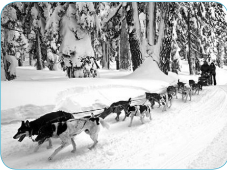
Effective pricing practice

Only when you have analyzed the gross margins of your current and future products, will you be able to determine how much additional profit each new product will contribute to the bottom line. Establish a policy to only go forward with products that are the most profitable. Eliminate new products with marginal profitability to prevent a pyrrhic victory.